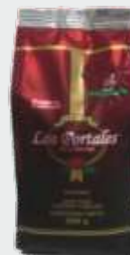
Café Tostado y Molido Regular Marca : Los Portales de Córdoba Presentación : Bolsa aluminizada Gramaje : 250 grs.