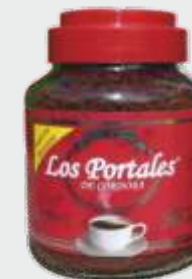
Café Soluble Aglomerado Regular Marca : Los Portales de Córdoba Presentación : Envase de Cristal Gramaje : 300 grs.