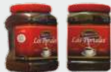
Café Soluble Aglomerado Regular Marca : Los Portales de Córdoba Presentación : Envase de PET Gramaje : 450 grs.