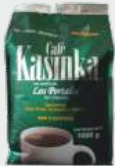
Café Tostado y Molido Sin cafeína Marca: Kasinka Presentación: Bolsa Mimentada Gramaje: 1000 grs