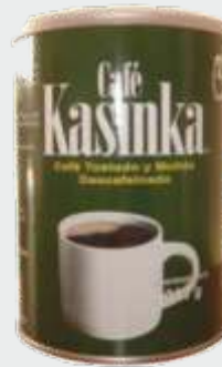
Café Tostado y Molido Sin cafeína Marca: Kasinka Presentación: Lata Gramaje: 369 grs