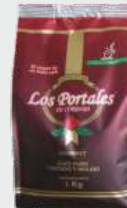
Café Tostado y Molido Regular Marca : Los Portales de Córdoba Presentación : Bolsa Aluminizada Gramaje : 1000 grs.