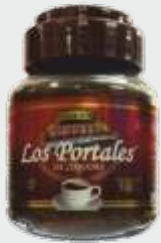
Café Soluble Aglomerado Regular Marca: Los Portales de Córdoba Presentación: Frasco de Cristal Gramaje: 100 grs.