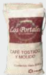
Café Tostado y Molido Regular Marca : Los Portales de Córdoba Presentación : Costal de Yute Gramaje : 500 grs.