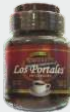
Café Soluble Aglomerado Regular Marca: Los Portales de Córdoba Presentación: Frasco de Cristal Gramaje: 150 grs.