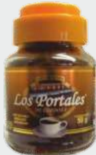
Café soluble aglomerado Mezclado Marca: Los Portales de Córdoba Presentación: Frasco de Cristal Gramaje: 50 grs.