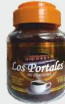
Café Soluble Aglomerado Mezclado Marca: Los Portales de Córdoba Presentación: Frasco de Cristal Gramaje: 100 grs.