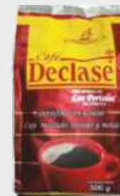
Café Tostado y Molido Mezclado Marca: Declase Presentación: Bolsa Aumentada Gramaje: 500 grs. Declase. Este producto está compuesto por 70% café y 30% azúcar marmelada. La bolsa de café es 100% azúcar. Cada taza de café con leche o con agua. El tostado y molido es un producto elaborado con café Arábica, se caracteriza por tener un buen cuerpo, marcado amargo y mandarina azúlar. Presentaciones: Bolsa aumentada de 500 y 250 grs.