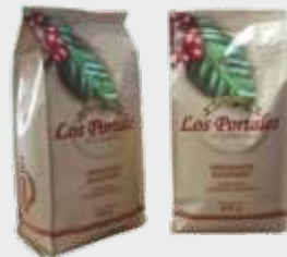
Café Tostado y Molido Orgánico Marca : Los Portales de Córdoba Presentación : Bolsa Aluminizada Gramaje : 454 grs.