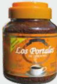
Café Soluble Aglomerado Mezclado Marca: Los Portales de Córdoba Presentación: Frasco de Cristal Gramaje: 200 grs.